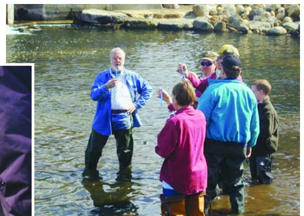
Monitor training in Rock County