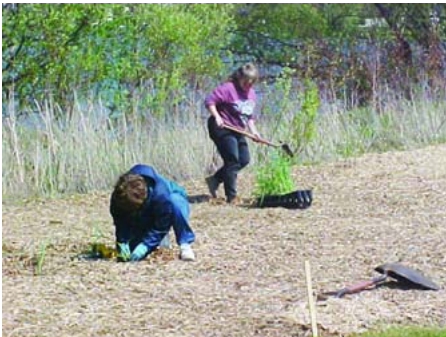
Before and after pictures of the 2002 Hustisford boat landing shoreline restoration demonstration project.

The 2001 project in Delavan resulted in additional native plant restoration in city parks and on Lake Comus in 2002. The Lake Comus Protection and Rehabilitation District funded the lake projects through a DNR Lake Protection Grant. Several restoration workshops have been held in Walworth County, in addition three are planned in Hustisford in 2003: two for contractors and landscapers and one for landowners.