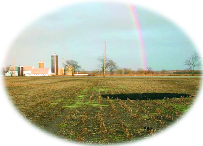
Sinkhole formed near Palmyra after 2002 Alaskan earthquake