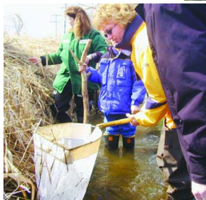
Collecting critters in the Headwaters Region

In the spring of 2003 the program will expand to Jefferson, Columbia and Walworth counties. $40,000 in grants and equipment from the Greater Milwaukee Foundation, Wisconsin Department of Natural Resources, UW-Extension and numerous small grants supported the program in 2002.