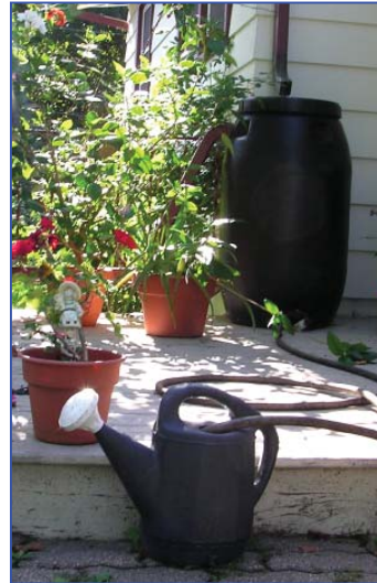
A rain barrel in use. Flowering plants love rain water as it is slightly acid, so in addition to saving precious water, a rain barrel will help give you beautiful flowering plants.

For a minimalist approach, install a rain barrel which captures water from downspouts. This prevents the flow from entering the storm sewer system and downstream water resources.