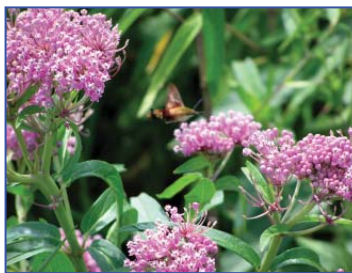
Hawk moth on swamp milkweed in a Jefferson rain garden.

While a rain garden might not be a good alternative for every site, there are still valuable management tools that can improve stormwater quality. Planning ahead and choosing the most appropriate method is an effective solution for enhanced watershed health.