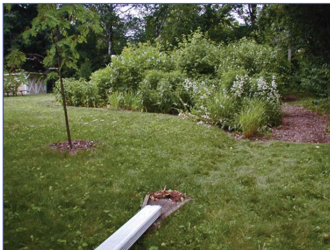
A rain garden down slope from a house's rain gutters and down spout. This rain garden features flowers and shrubs and blends nicely with existing trees and shrubs.