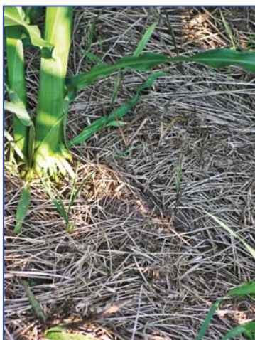
A Koepke corn field is left with significant residue and composted manure which prevents erosion and runoff.