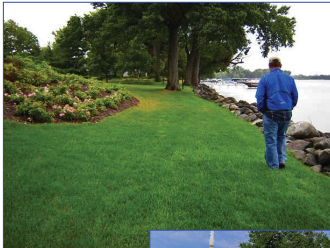
A new look to the Executive Residence:

A group of citizens who participated in the Wisconsin Lake Leaders Institute led an effort to gain support and approval for this project.