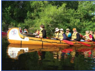
Voyageur canoe during SYLDR