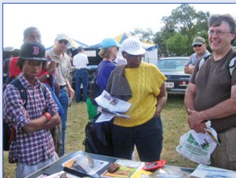
Town and Country RCD was represented in the Alternative Car Show at the MREA with a 2002 Jetta Turbo that had been inexpensively modified post-factory to run on ethanol.

Sponsored by: R&G Miller & Sons, Inc and Town & Country RC&D with funds from the Grazing Lands Conservation Initiative Program (GLCI) and the Wisconsin Dept. of Ag. Trade & Consumer Protection.