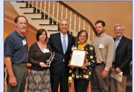
Rock River Coalition was honored for their work to improve the basin using the DNR River Grant Program at the River Alliance of Wisconsin's Annual Confluence in May.

Sept 28 Rock River Basin TMDL Public Informational Hearing 12:30 - 4:00pm Lake Mills Municipal Building