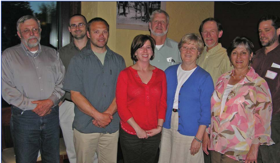
2010 Rock River Board was elected at the annual meeting in May.