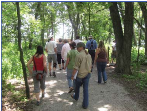
Members of Town and Country's Invasive Species Issue Team met June 25th for a tour of Dorothy Carnes Park in Jefferson County.

The group members, made up of members of different certified weed management associations, share information about grants, events and help each other accomplish objectives.