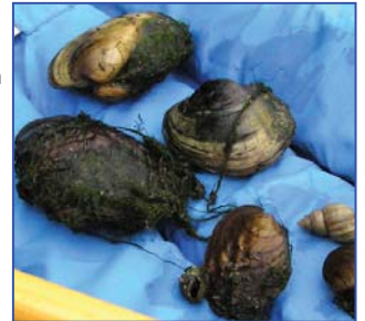
Bark River mussels found on a Coalition field trip.