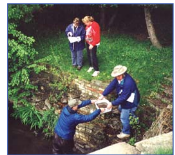
Veteran monitors helping new monitors is what the Snap Shot Day is all about. Here Friends of Cam-Rock Park help each other monitor the Koshkonong Creek near Rockdale, where they have been watching the creek restore itself since the dam was removed in 2000.