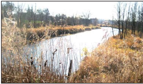
Koshkonong Creek stretches from Sun Prairie down to Lake Koshkonong and eastward almost to Rock Lake. It's a fairly flat watershed that was known historically for its prairies and marshes. Today this watershed is primarily agricultural but with many growing communities including Sun Prairie, Cottage Grove, Cambridge, Deerfield, and Rockdale.