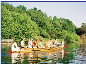
Wisconsin legislators during RRC's "Send Your Legislator Down the River."

Our first chapter is the Friends of Badfish Creek Watershed.